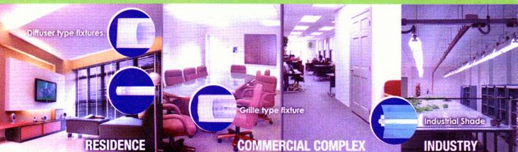
Diffuser type fixtures: